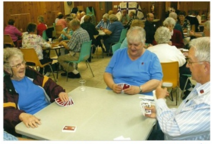
Learn to play Bid-Euchre Cost $5.00

Fundraiser for the North Lanark Senior Games Association